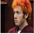
Batman shooting: Accused in court July 24, 2012 at 12:00 AM