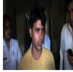
Honour killing: Family strangles girl to death in Mathura July 24, 2012 at 12:00 AM