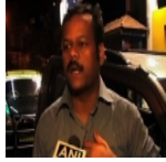
Locals and Politicos denounce petrol price hike July 24, 2012 at 12:00 AM