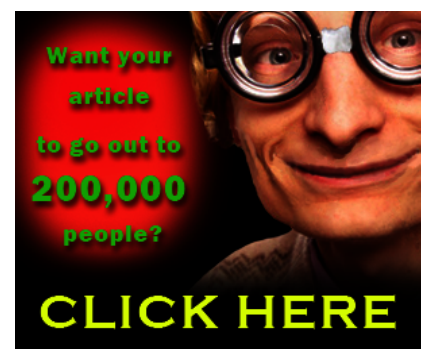
Create Your Own Releases:

<script type="text/ja google_ad_client = "p google_ad_width = 160 google_ad_height = 60 google_ad_format = "I google_ad_format = "I //2007-10-11: Ion Pub google_ad_channel = " //--> </script src="http://pagead2 </script>