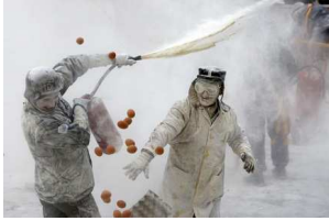
12-28-09: The Star-Ledger's Photos of the Day