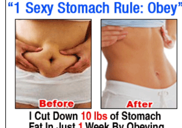
Fat In Just 1 Week By Obeying