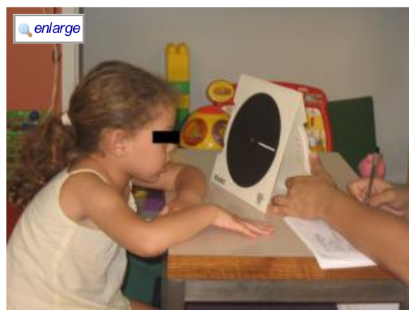
Tests carried out on a premature girl.

A population sample of 35 very premature children is being taken for this project, together with the same number of healthy children, all of them born between 2000 and 2001, with their parents' authorisation. Special attention has been paid to the fact that both the children and their parents have similar educational and social levels, as the stimulation they get in the early stages of their lives has a decisive influence in their later development.