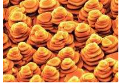
These are gastropods' nacre towers.