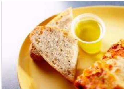
Download full size image